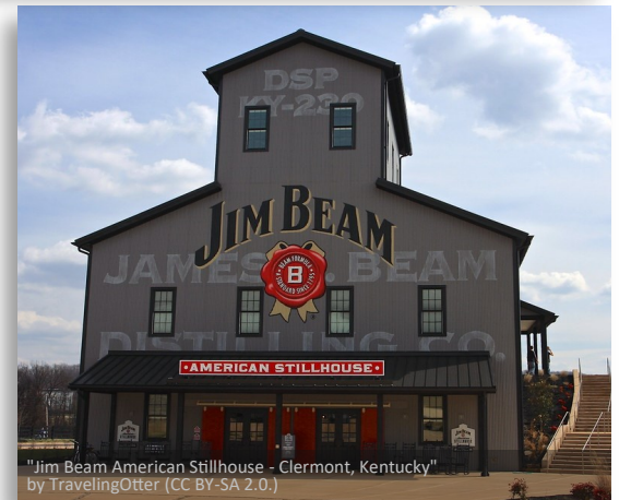
"Jim Beam American Stillhouse - Clermont, Kentucky"