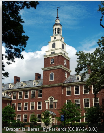
"DraperHallBerea" by ParKerdr (CC BY-SA 3.0.)