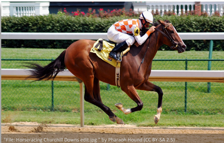
"File: Horseracing Churchill Downs edit.jpg"