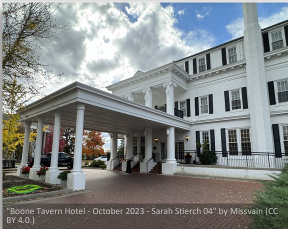
"Boone Tavern Hotel - October 2023 - Sarah Stierch 04" by Missvain (CC BY 4.0.)

Tour Cost Per Person: DOUBLE: $1,362 SINGLE: $1,642 TRIPLE: $1,272 QUAD: $1,222