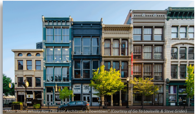
"Main Street Whisky Row Cast Iron Architecture Downtown"